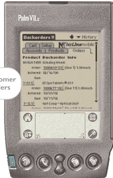
view customer backorders