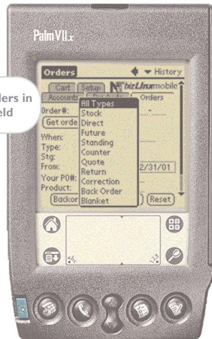
enter orders in the field